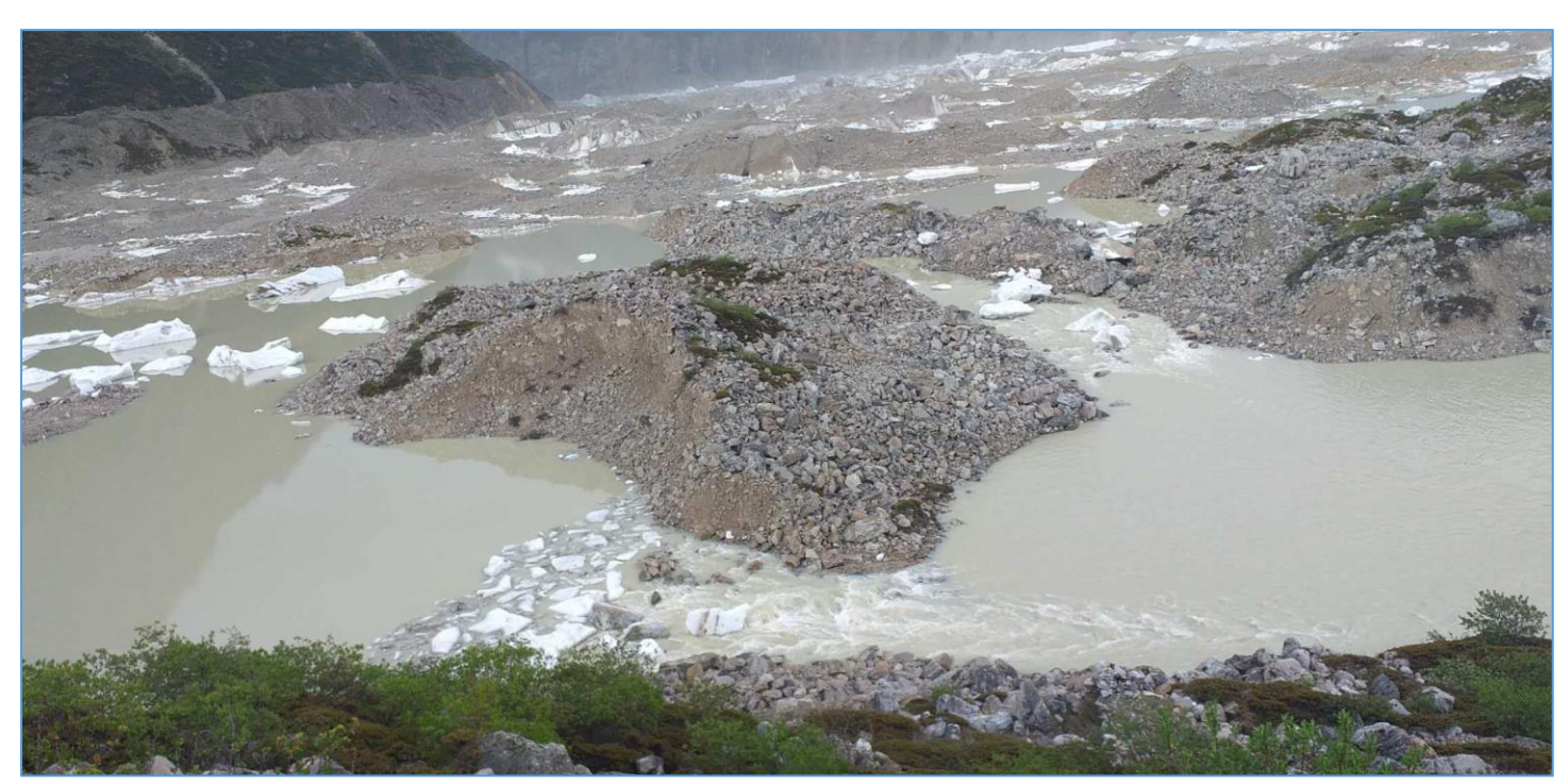
Figure 1: Current situation of Thorthormi Main Lake outlet at 05:54 PM..

National Center for Hydrology and Meteorology, NCHM has intensified the monitoring of the Thorthormi Lake since the outburst of subsidiary lake on 20<sup>th</sup> June, 2019 with the field observers stationed at Thanza (Lunana) deputed for 24/7 field watch until further notice. Water level as reported from the field has been normal with very little changes as of now and the center is relying on the field observers for any update since Thorthormi AWLS has been damaged during the event.