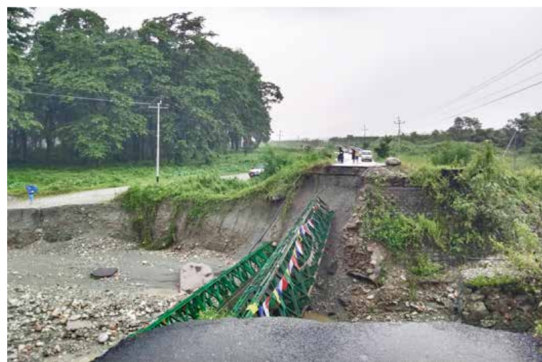
► A Bailey bridge near the domestic airport in Gelephu collapsed at around 5am yesterday. The highway opened to traffic after a bypass was constructed. No casualties were reported. > Pg 7

THAT THE PEOPLE SHALL BE INFORMED FRIDAY, AUGUST 13, 2021 • Nu 20